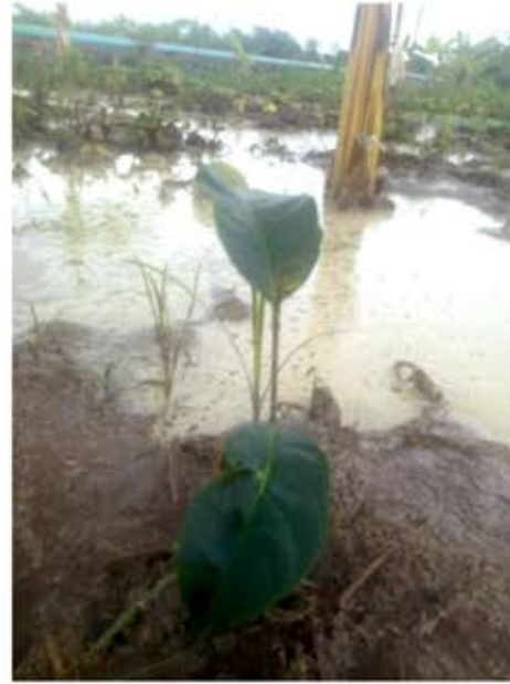
Waterlogged farms in Kasinyi village: A reminder that the battle against environmental and human rights injustices continues

We stand firmly with the communities resisting this project. Their bravery in speaking out against injustices has shed light on corporate greed and governmental complacency. At Tasha Research Institute, we will continue to amplify their voices, support their fight, and demand accountability from all parties involved.